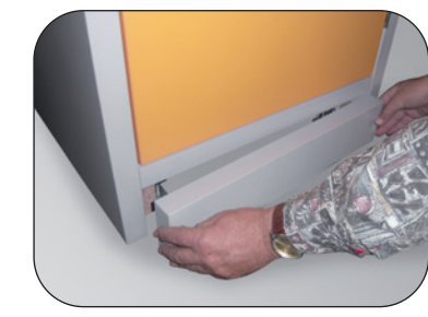
Socie included, with removable panel