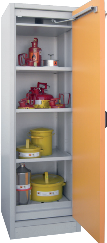
SiS Type 30 / 600, Article no. B80-2603-A, door RAL 1007 - daffodil yellow, incl. 3 shelves, base sump tray and perforated cover plate