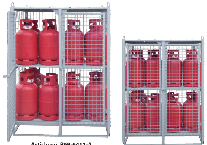
Article no. B69-6411-A