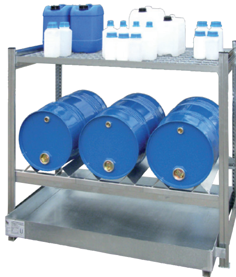
AR 1150 / 360 GR, Article no. R74-1052-A