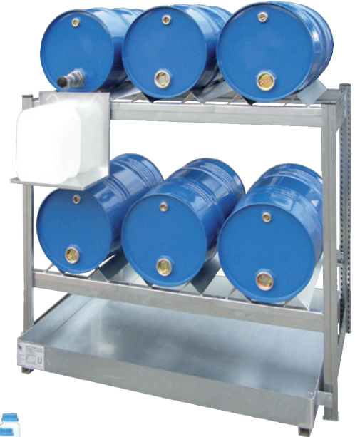
AR 1150 / 660, Article no. R74-1050-A, with optional can support