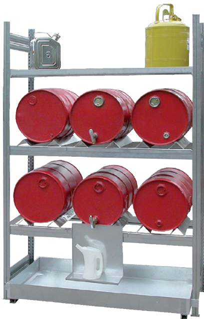
AR 2000 / 660 GR, Article no. R74-1056-A, with optional can support