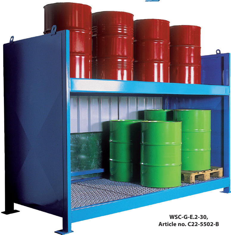
WSC-G-E.2-30, Article no. C22-5502-B