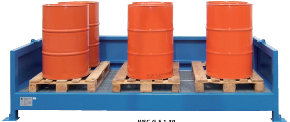
WSC-G-E.1-30, Article no. C22-5501-B