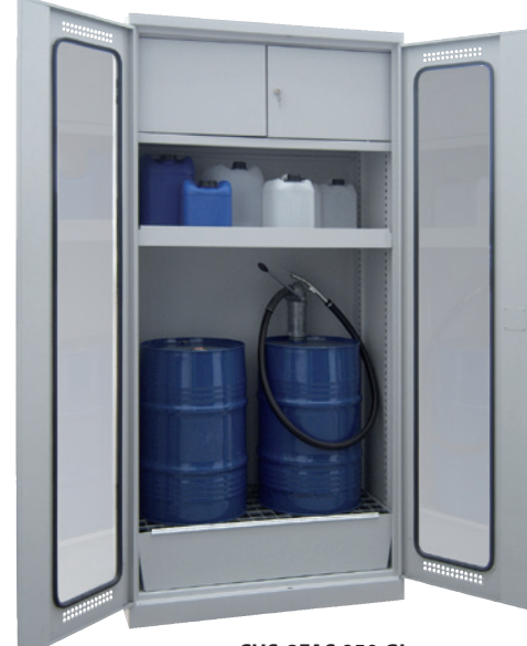
CHS-2FAS 950 GL, Article no. B80-6239-A, with optional safe compartment